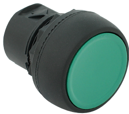
D7P – Plastic housing with a black plastic captive bezel.

Front elements, including pushbuttons, mushroom operators and selector switches, are IP 66 protection against submersion, oil and dirt, making them reliable in the toughest industrial environments. Metal operators are Type 4/13 and plastic operators are Type 4/4X/13.