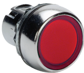
D7M – Die-cast metal housing and locking ring with shiny metal captive bezel.