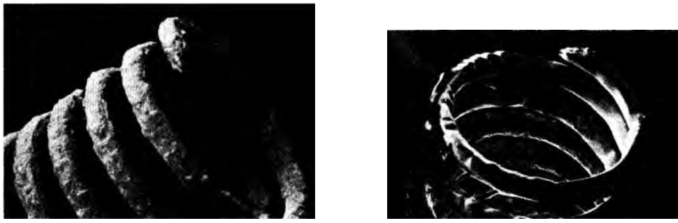
After AC Operation