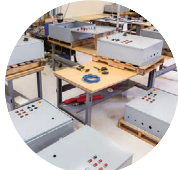
A Thriving Company in a Dynamic Industry