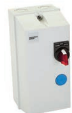
NEMA KWIKstarters with HOA Selector Switch

Series CNX Special Purpose Contactors are standard CA7 contactors that have been tested, approved and labeled by UL for heating, ventilation and air conditioning (HVAC) applications