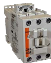
CNX Special Purpose Contactors