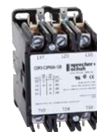
CDP2 Definite Purpose Contactors