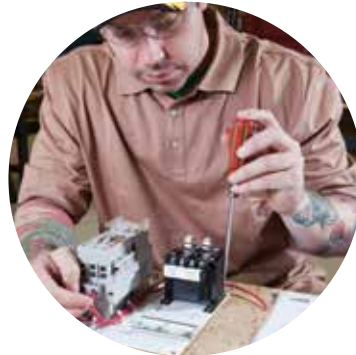
Industrial Certified Panel Shop