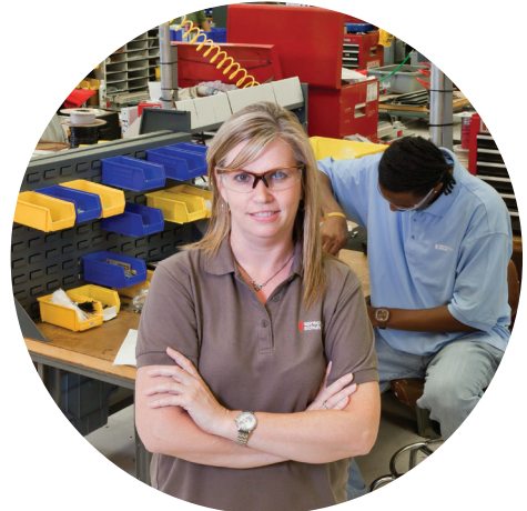
Leading Edge Manufacturing Facilities

We offer a wide range of products starting with high performing contactors and overload relays to robust power supplies and efficient disconnect switches.