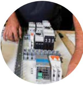
High Performing, Efficient Products