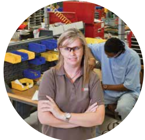
Leading Edge Manufacturing Facilities

We offer a wide range of products starting with high performing contactors and overload relays to robust power supplies and efficient disconnect switches.