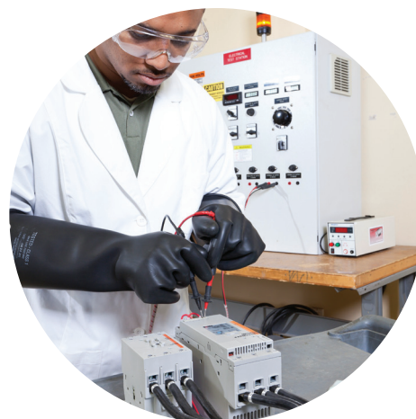
Engineering + Testing Services

We consistently work on improving our products and processes, maintaining industry standard certifications (national and international) in order to best serve you in all areas of your business. Sprecher + Schuh's elite panel shop is UL508A and cULus Approved as well and ISO 9001 certifications. We focus on quality , safety , reliability and efficiency .