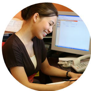
Exceptional Customer Service and Technical Support