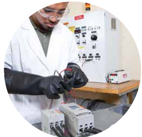
Engineering + Testing Services

We consistently work on improving our products and processes, maintaining industry standard certifications (national and international) in order to best serve you in all areas of your business. Sprecher + Schuh's elite panel shop is UL508A and cULus Approved as well and ISO 9001 certifications. We focus on quality , safety , reliability and efficiency .