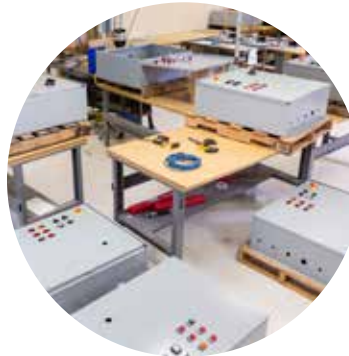
A Thriving Company in a Dynamic Industry