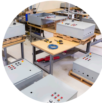
A Thriving Company in a Dynamic Industry