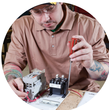
Industrial Certified Panel Shop