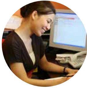
Exceptional Customer Service and Technical Support