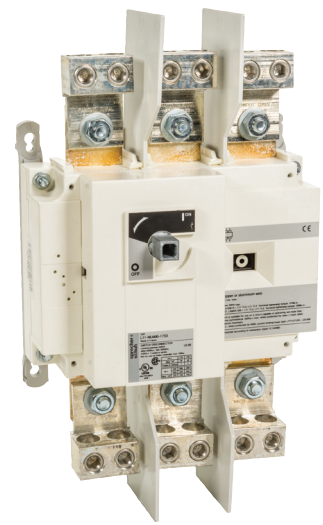
L11-NU400-1753 with Lug Kits