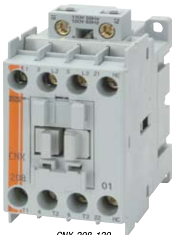
CNX-208-120 Special Purpose contactor