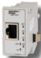
CEP7-ETN Ethernet Network Communications Module