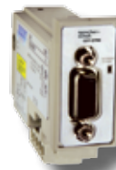
CEP7-EPRB Profibus Network Communications Module