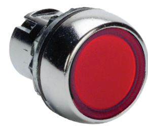
D7M – Die-cast metal housing and locking ring with shiny metal captive bezel.

Sprecher + Schuh's rugged D7 pilot devices offer maximum flexibility and a wide choice for all applications. This 22mm line is aesthetically appealing and modularly designed to make assembly and interchangeability easy. The D7 operators are available in two different body styles to meet every application need. Both operators exhibit a stylish, low profile appearance while maintaining the rugged performance necessary for demanding environments.