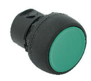
D7P – Plastic housing with a black plastic captive bezel.

The economical solution for high performance control, signaling and switching applications