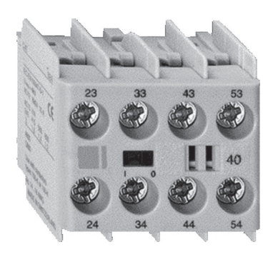
CS8 front mount auxiliaries are positive guidance

Despite increasing complexity, control systems and installations must become increasingly compact. And the CS8 Miniature Relay System packs maximum performance into minimum space.