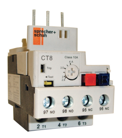
Sprecher + Schuh provides outstanding motor protection with our CT8 Thermal Overload Relay

A separate NO signal contact is also provided on CT8 overloads which is isolated from the NC trip contact. This permits the use of a trip signal voltage different than that of the control voltage.